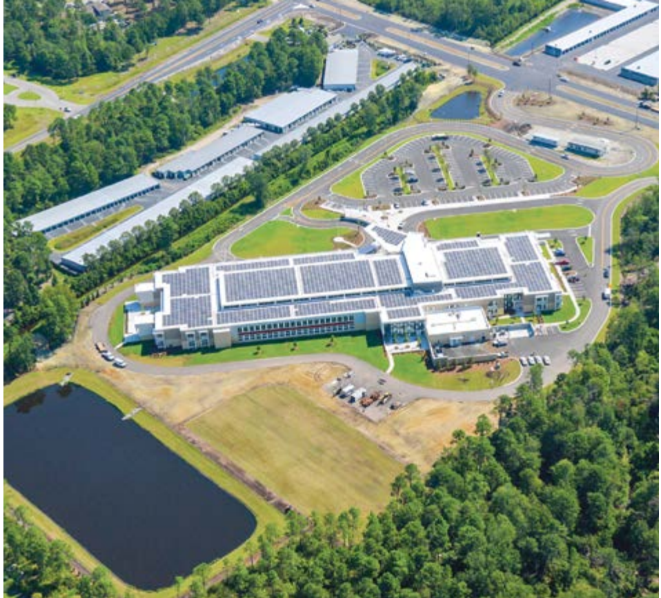
Aerial view of Ten Oaks Middle School, Horry County Schools.

Over 40 years, Sandy Grove Middle School will save Hoke County Schools $37.2 million.