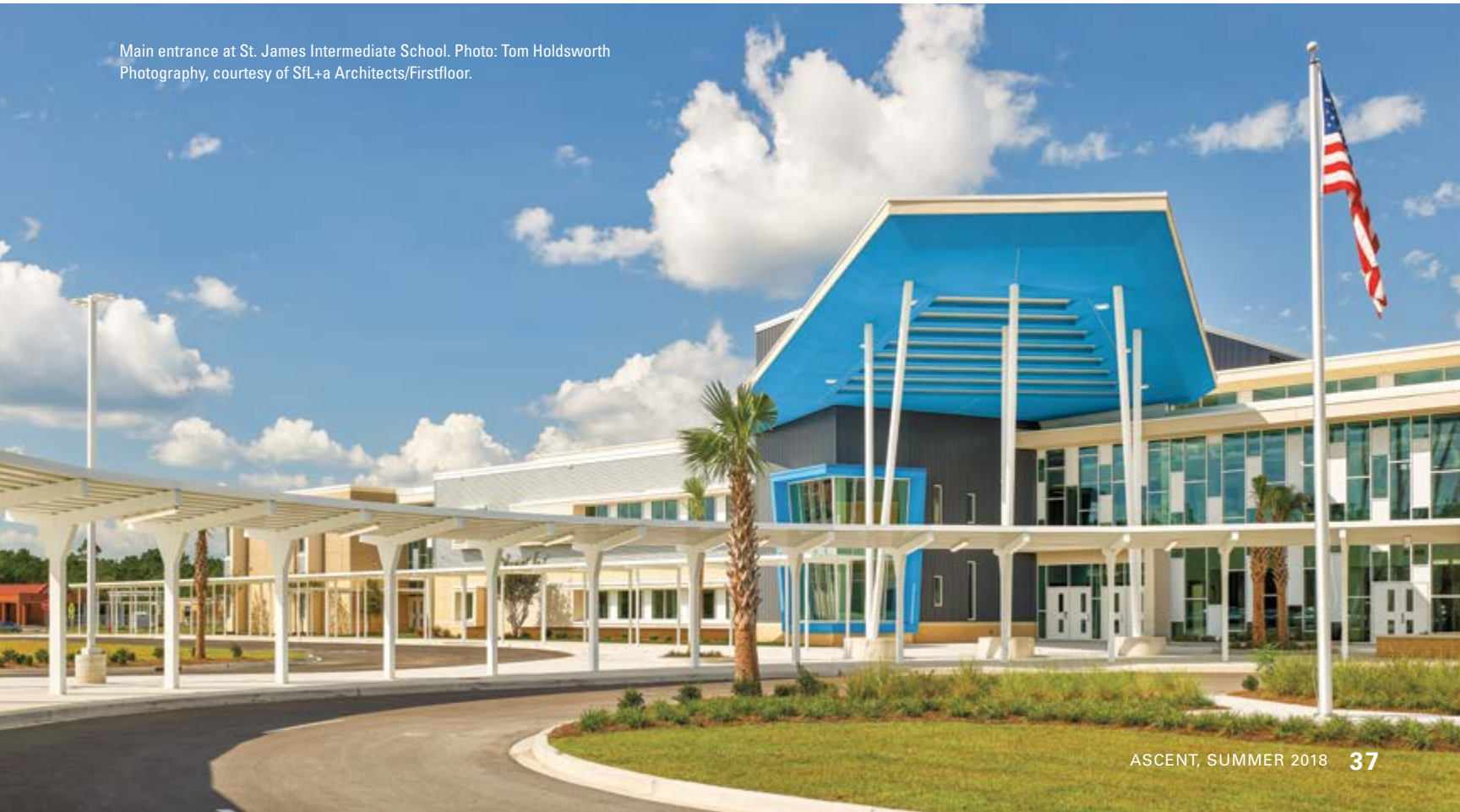
Main entrance at St. James Intermediate School.

Anytime you start a project, you should stand back and look at the big picture goals before getting into the weeds analyzing systems. If you use this approach, you will likely eliminate the infinite number of options that usually lead to ordinary buildings. What are we trying to say here? Focus on the big picture goals.