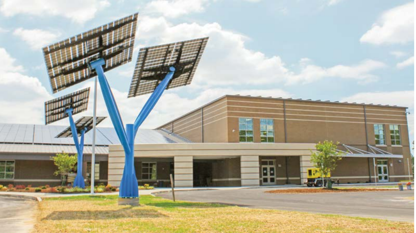
Solar trees at Sandy Grove Middle School. Photo: SfL+a Architects/ Firstfloor.

The traditional LCCA process has a very narrow perspective.